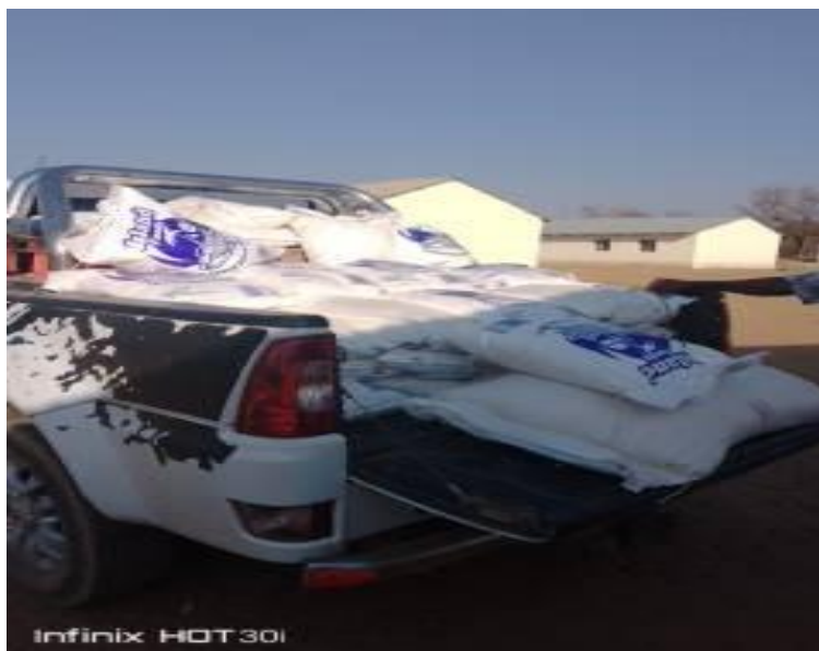
Maize meal being delivered at Redbank primary for Holiday feeding