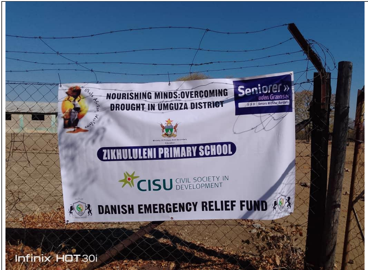
Each school has a banner composed of name of school and logos of all the key partners as shown above