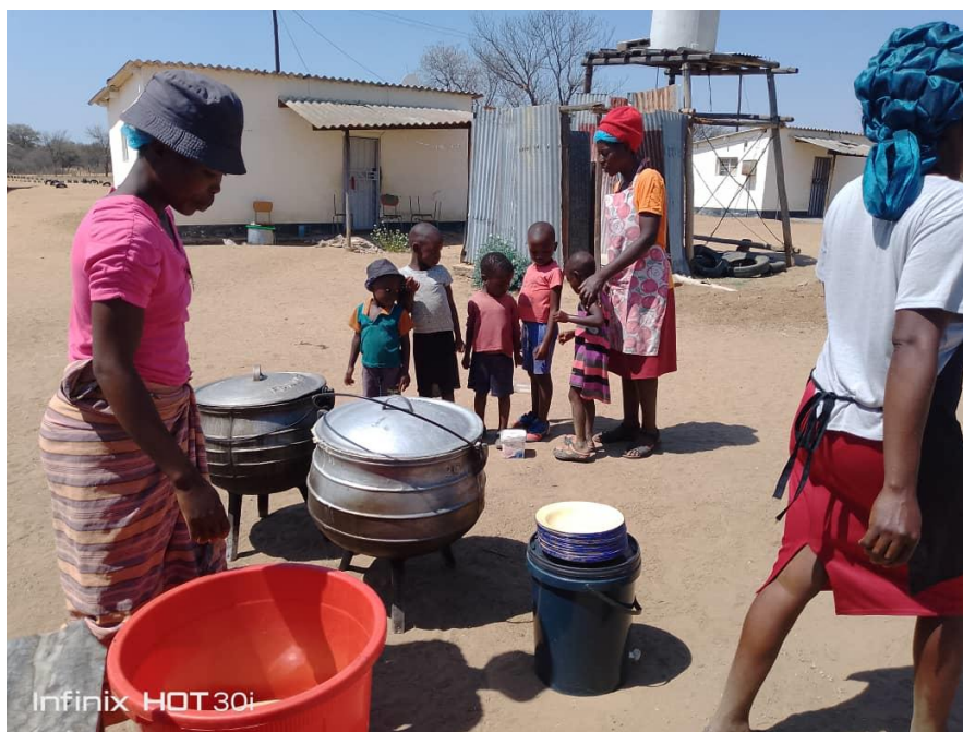
Redbank learners lining up to be served