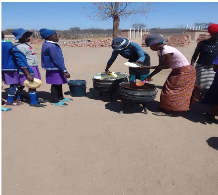
Learners being served their meal whilst standing in a single file