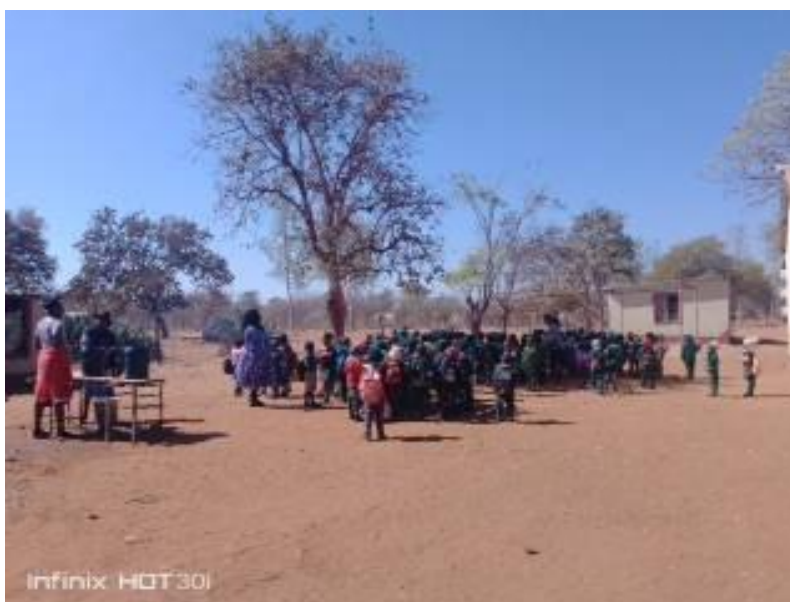
George Silundika primary learners being addressed before going for their meal

George Silundika primary failed to feed during the holiday because no one was present to cook and monitor the holiday feeding. Their enrollment has increased during the past months since the feeding program began from 130 to 136 students.