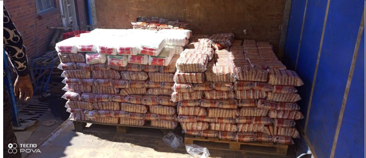
Beans purchases to make sure all schools had the adequate supplies throughout