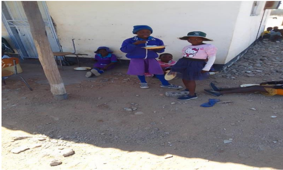
Redbank learners having their meal during the holidays

This school has a large enrolment and decided to continue full throttle feeding during the holidays. During Monitoring and Evaluation it was pleasing to see the cooperation of parents and teachers managing well the entire system.