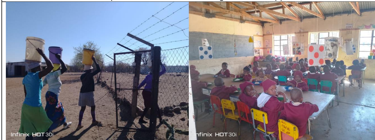
Collection of water by parents and cooking team