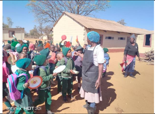
Inspection of plates for cleanliness is done