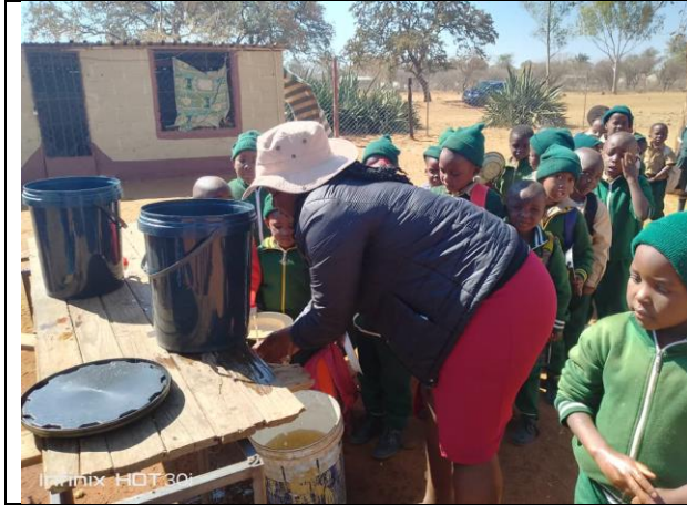
Queuing for cleaning hands before receiving food