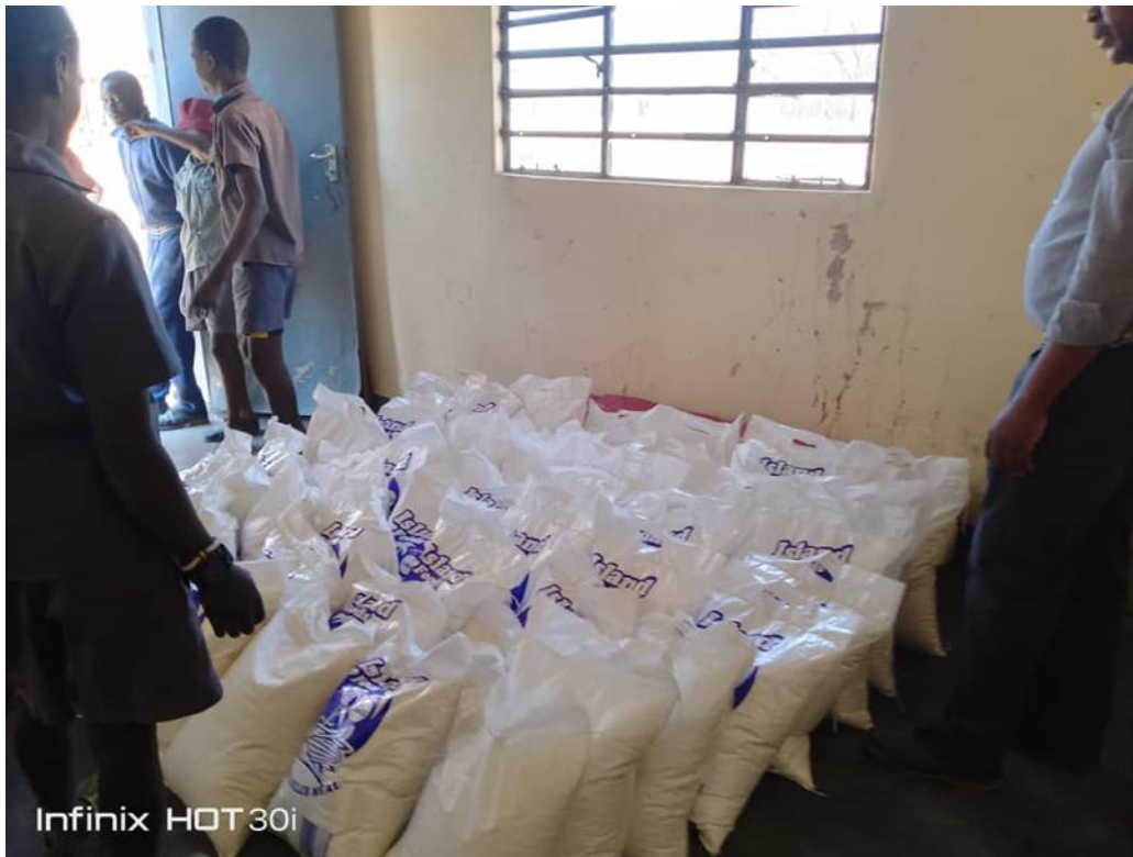
Mealie-meal delivered at Redbank