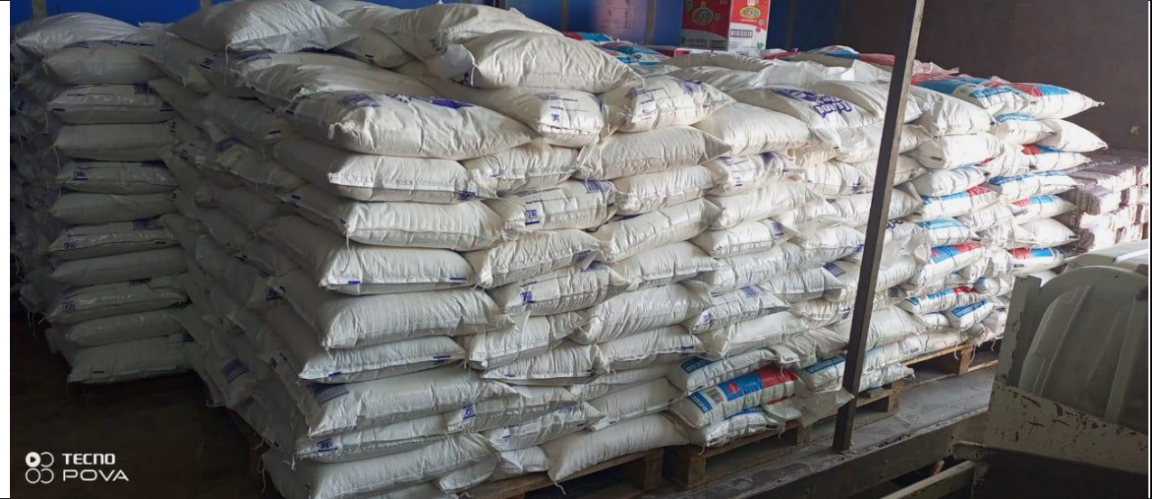
Above: Mealie meal purchases was secured and made sure that the expiry dates were in conformity to the expected health regulations accordingly.