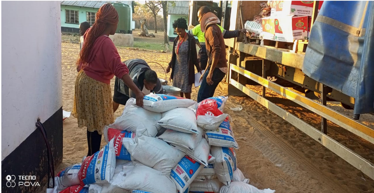
Above is a picture revealing delivery of food which consisted of cooking oil, maize meal, sugar beans and salt