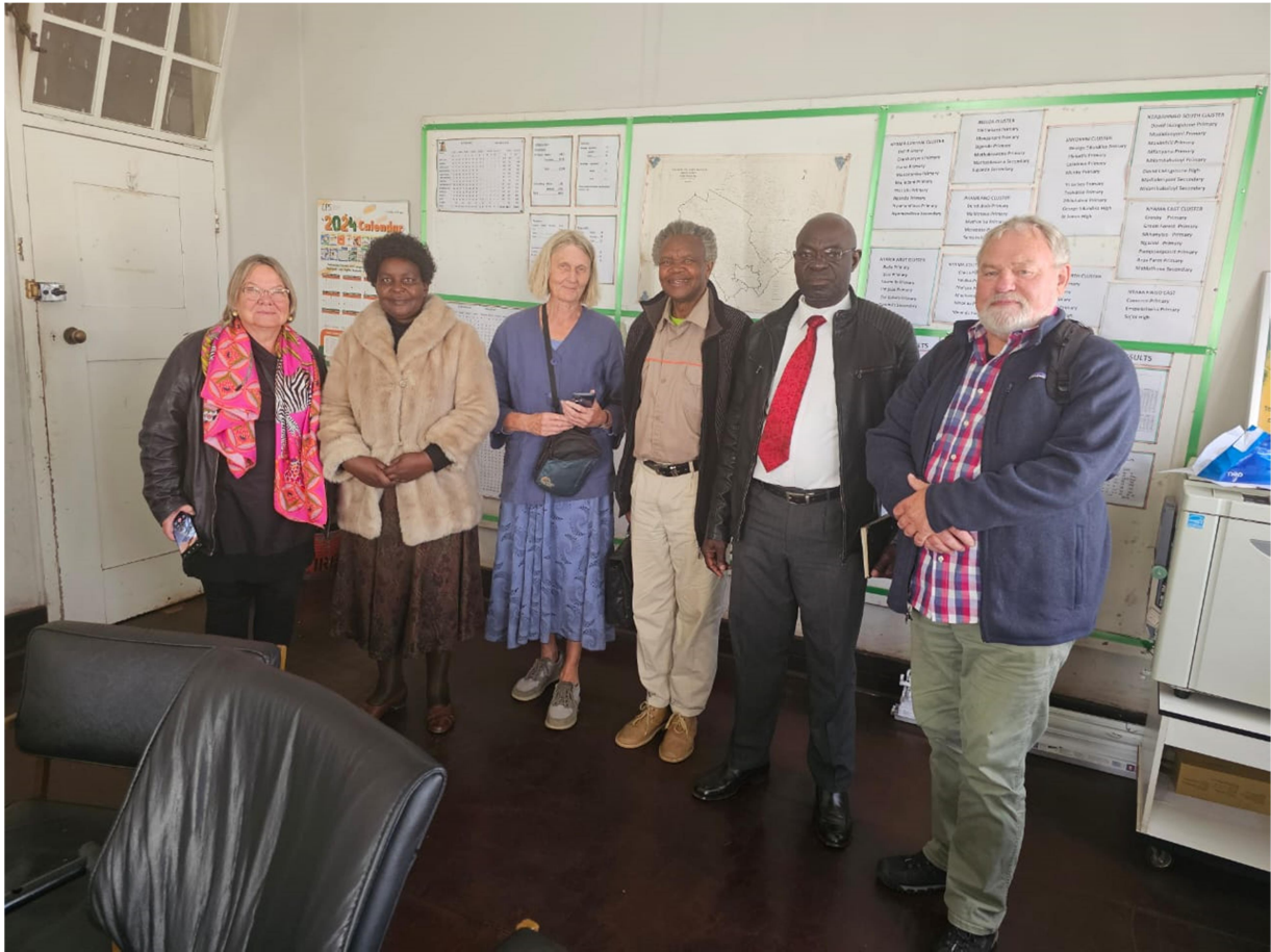
Courteous Call at the District Education Inspector