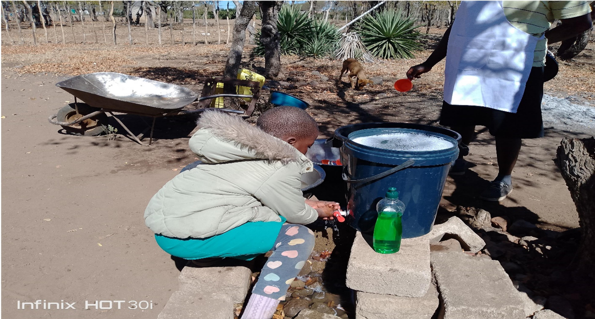
Above is a picture of students washing their hands

In addition, each school was provided with registers, consumables request forms and stock sheets which are used to monitor the effectiveness and consumption of the food items each day. The cooks have aprons and hairnets for hygienic purposes and before being served food each learner goes through the hand washing facilities provided by NAWT to avoid any disease outbreaks during the feeding period.