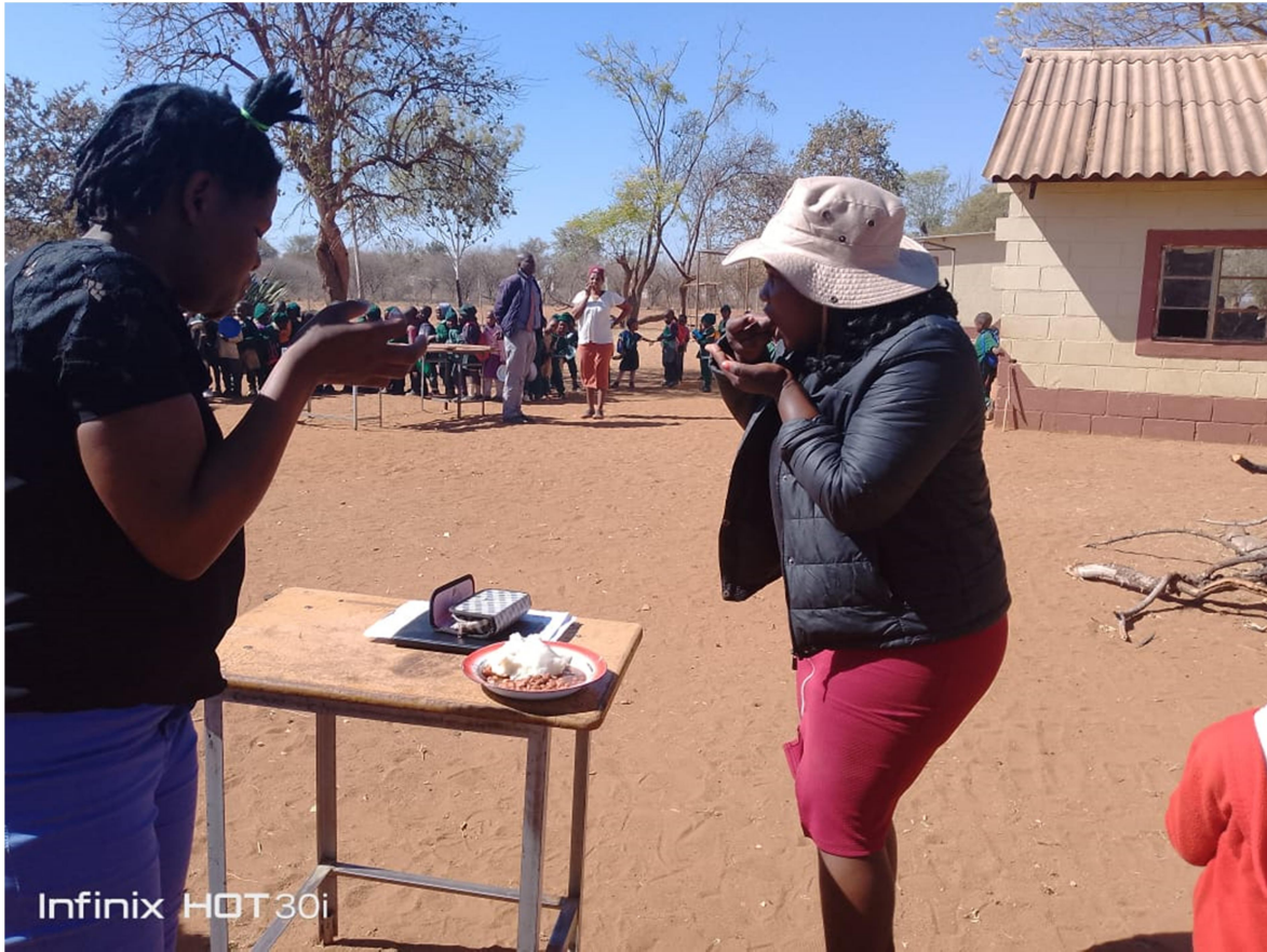
The picture above shows NAWT officers tasting food that is being prepared for students