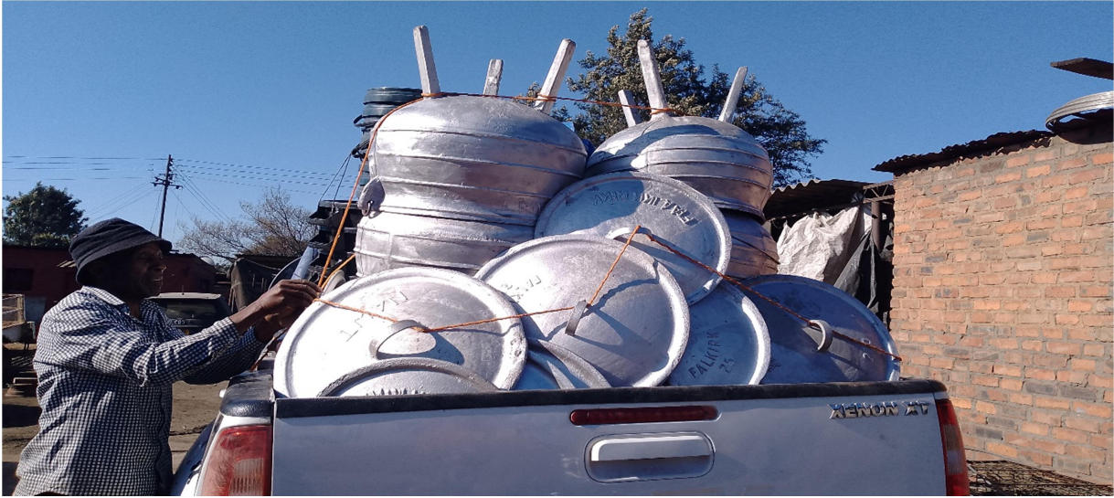
Above is a picture of cooking pots to use for cooking at all schools

In addition, each school was provided with registers, consumables request forms and stock sheets which are used to monitor the effectiveness and consumption of the food items each day. The cooks have aprons and hairnets for hygienic purposes and before being served food each learner goes through the hand washing facilities provided by NAWT to avoid any disease outbreaks during the feeding period.