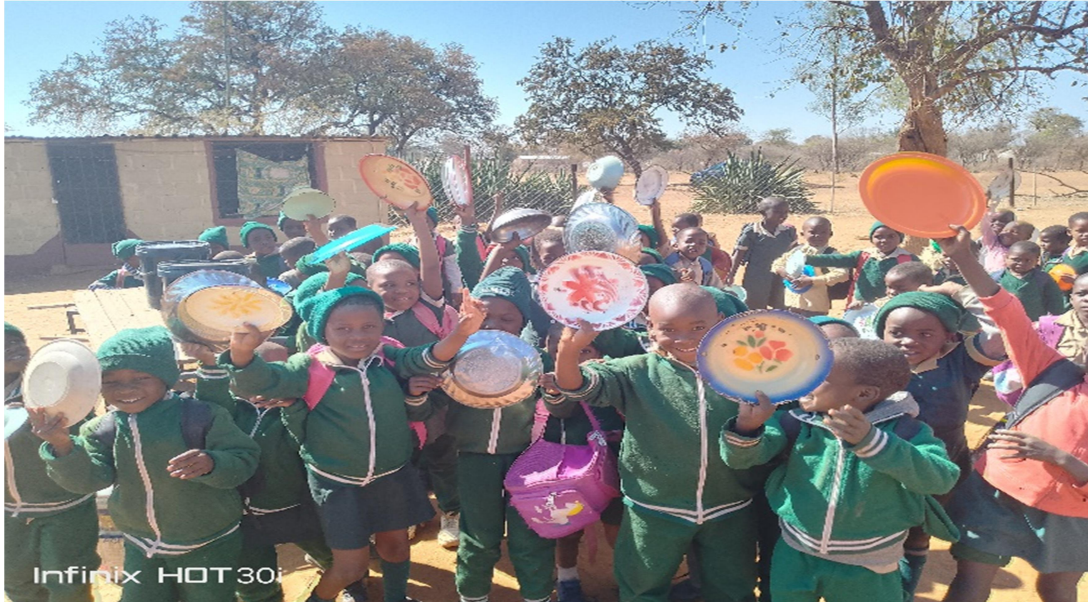
Happy learners from Nyamandlovu primary school on the first day of feeding